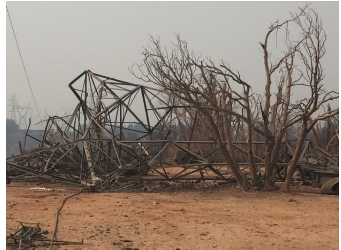
2018 Carr Fire "firenado" damage