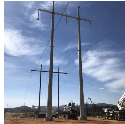
2020 permanent structure install at Carr Fire site